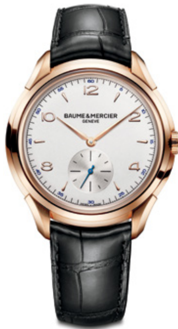
CLIFTON 18K ROSE GOLD 42MM