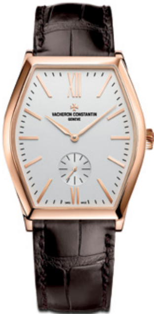
MALTE SMALL SECONDS 18K ROSE GOLD 37 X 47MM