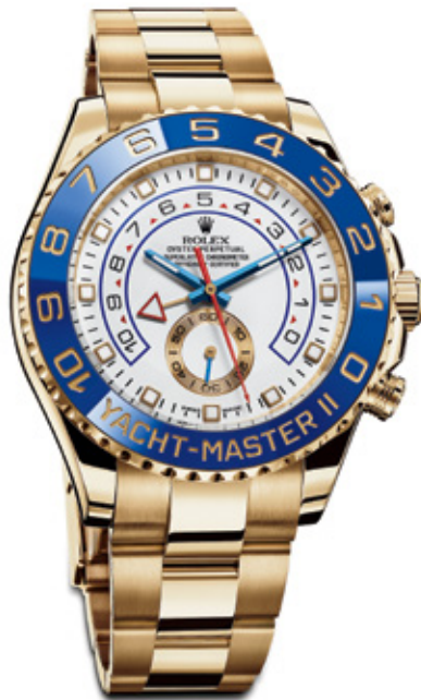
OYSTER PERPETUAL YACHT-MASTER II 18K YELLOW GOLD 44MM