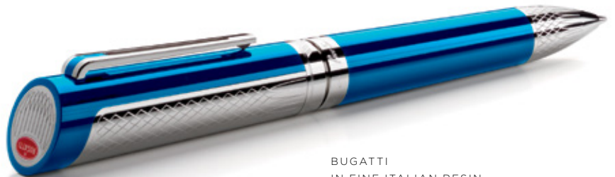
BUGATTI IN FINE ITALIAN RESIN, INDIGO BLUE