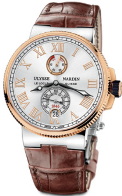
MARINE CHRONOMETER MANUFACTURE 18K ROSE GOLD AND STAINLESS STEEL 45MM