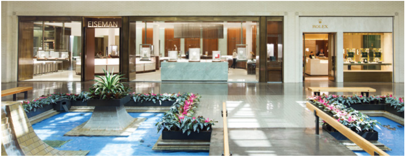
EISEMAN JEWELS | NORTHPARK CENTER