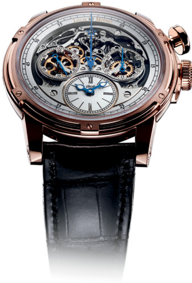
MEMORIS 18K ROSE GOLD LIMITED EDITION OF 60 46MM