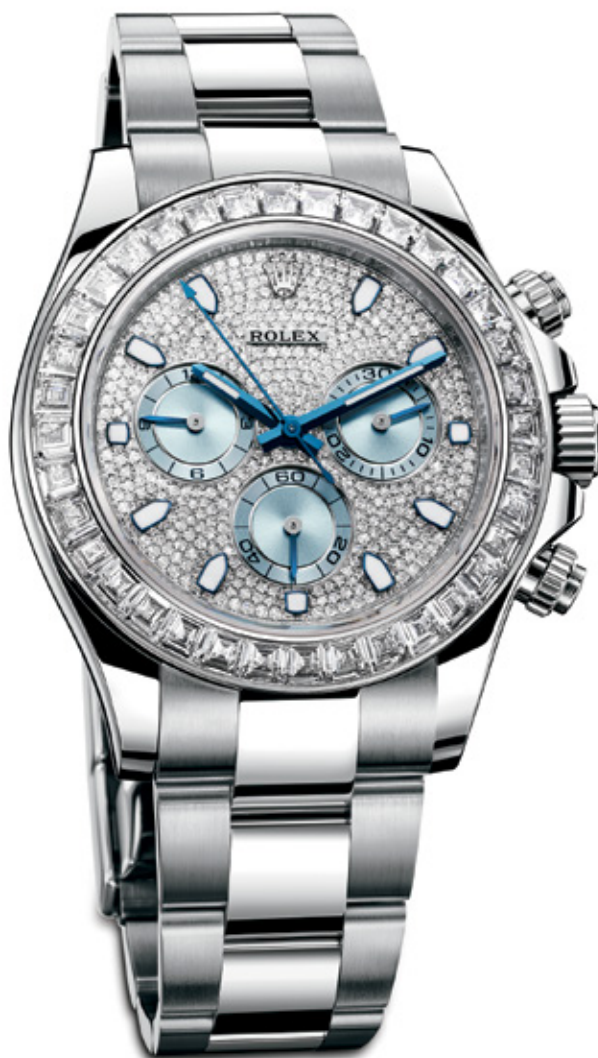
OYSTER PERPETUAL COSMOGRAPH DAYTONA PLATINUM AND DIAMONDS 40MM