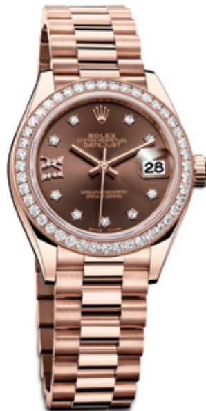
OYSTER PERPETUAL DATEJUST 18K ROSE GOLD AND DIAMONDS 28MM