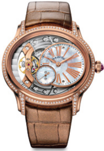
NEW MODEL MILLENNARY HAND-WOUND 18K PINK GOLD AND DIAMONDS 39.5MM