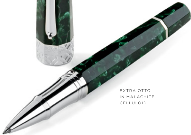
EXTRA OTTO IN MALACHITE CELLULOID