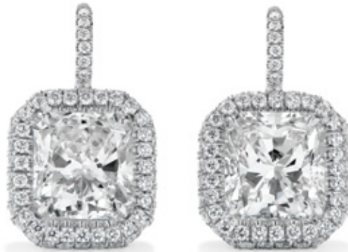
RADIANT CUTS 4 CARATS TOTAL WEIGHT COMBINED