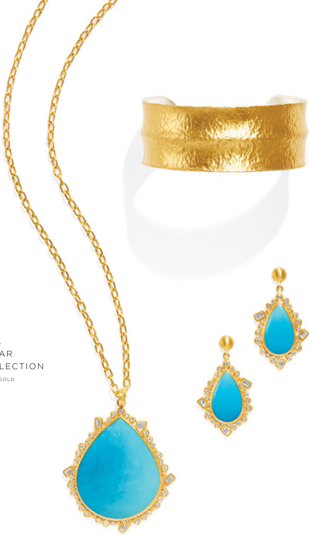
LIKA BEHAR COLLECTION IN 24K GOLD