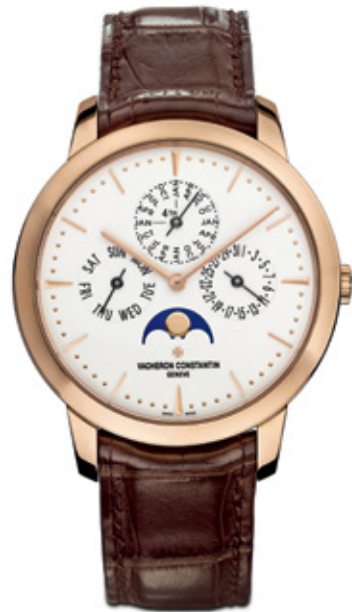
PATRIMONY PERPETUAL CALENDAR 18K ROSE GOLD 41MM