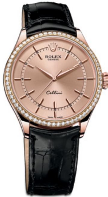
CELLINI TIME 18K ROSE GOLD AND DIAMONDS 39MM