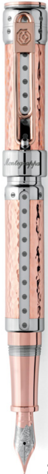
GRAPPA LIMITED EDITION IN COPPER AND STEEL