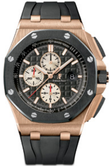
ROYAL OAK OFFSHORE CHRONOGRAPH 18K PINK GOLD AND BLACK CERAMIC 44MM