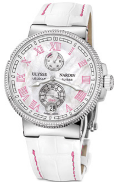
MARINE CHRONOMETER MANUFACTURE STAINLESS STEEL AND DIAMONDS 43MM