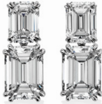
EMERALD CUTS 17.50 CARATS TOTAL WEIGHT COMBINED