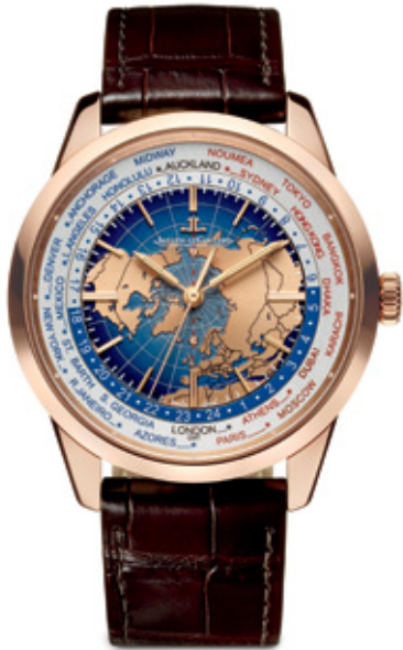
NEW COLLECTION GEOPHYSIC UNIVERSAL TIME 18K PINK GOLD 41.6MM