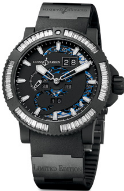
MARINE PERPETUAL CALENDAR BLACK STEEL AND DIAMONDS LIMITED EDITION OF 28 45.8MM