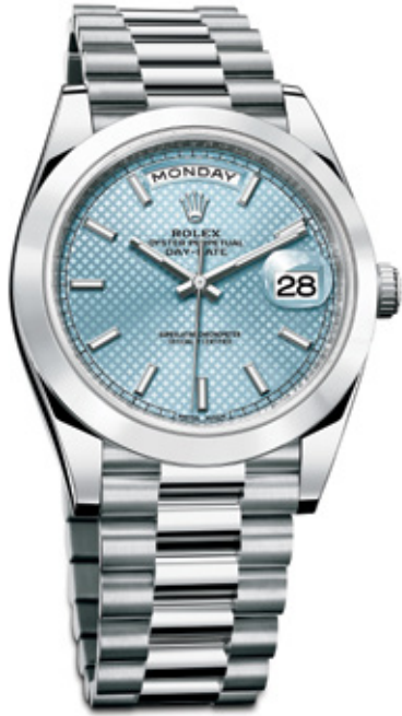
OYSTER PERPETUAL DAY-DATE PLATINUM 40MM