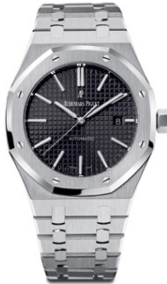
ROYAL OAK SELFWINDING STAINLESS STEEL 41MM