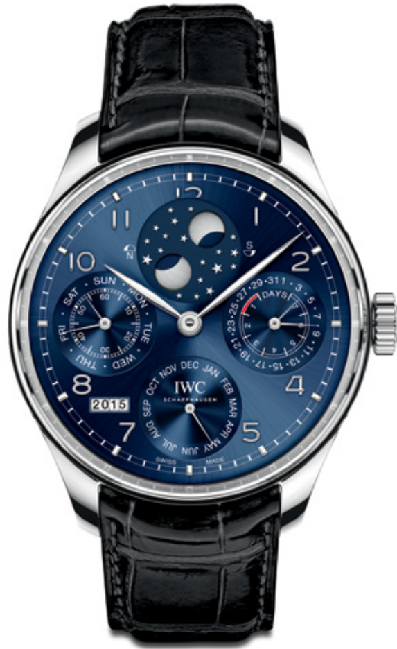
PORTUGIESE PERPETUAL CALENDAR 18K WHITE GOLD 44.2MM