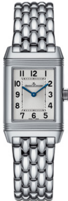
REVERSO CLASSIC SMALL DUETTO STAINLESS STEEL 21 X 34MM