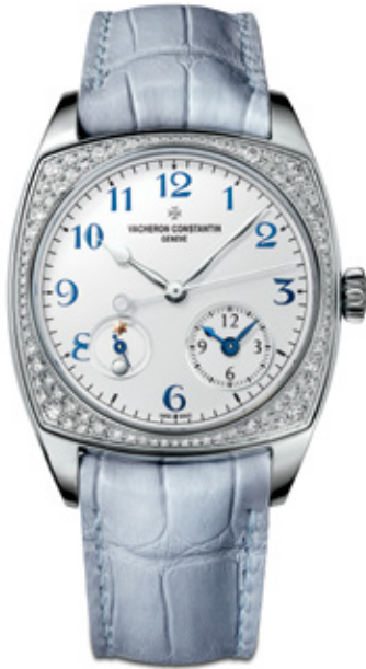
260TH ANNIVERSARY COLLECTION HARMONY DUAL TIME 18K WHITE GOLD AND DIAMONDS 37MM