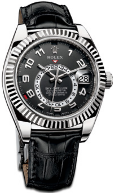
OYSTER PERPETUAL SKY-DWELLER 18K WHITE GOLD 42MM