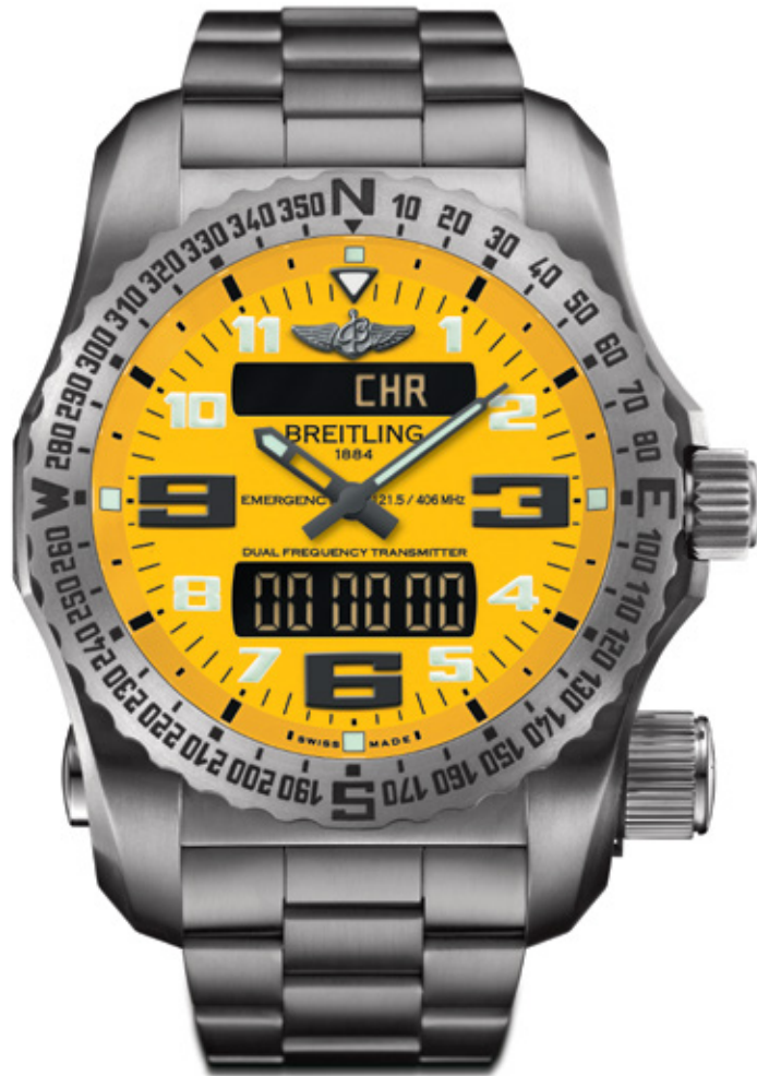
EMERGENCY WITH DUAL-FREQUENCY LOCATOR BEACON TITANIUM 51MM