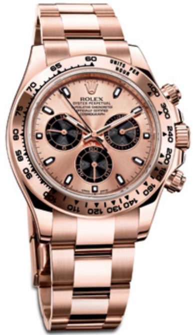
OYSTER PERPETUAL COSMOGRAPH DAYTONA 18K ROSE GOLD 40MM