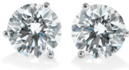
ROUND BRILLIANT CUTS 8 CARATS TOTAL WEIGHT COMBINED