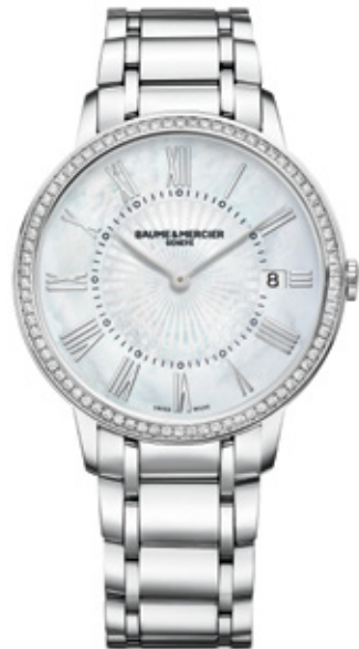
CLASSIMA STAINLESS STEEL AND DIAMONDS 36.5MM