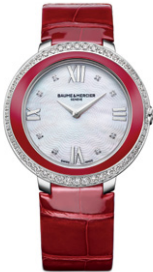
PROMESSE STAINLESS STEEL AND DIAMONDS 34MM