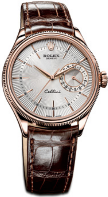
CELLINI DATE 18K ROSE GOLD 39MM