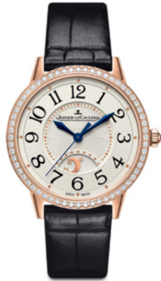
RENDEZ-VOUS NIGHT & DAY 18K PINK GOLD AND DIAMONDS 34MM